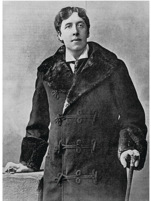
Oscar Wilde